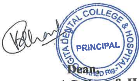
Dean, Yogita Dental College & Hospital, Khed

During this program college shall be responsible for the student conduct and behaviour of theirs while the Sub-District Hospital, Kalambani shall be responsible for their behaviour and conduct